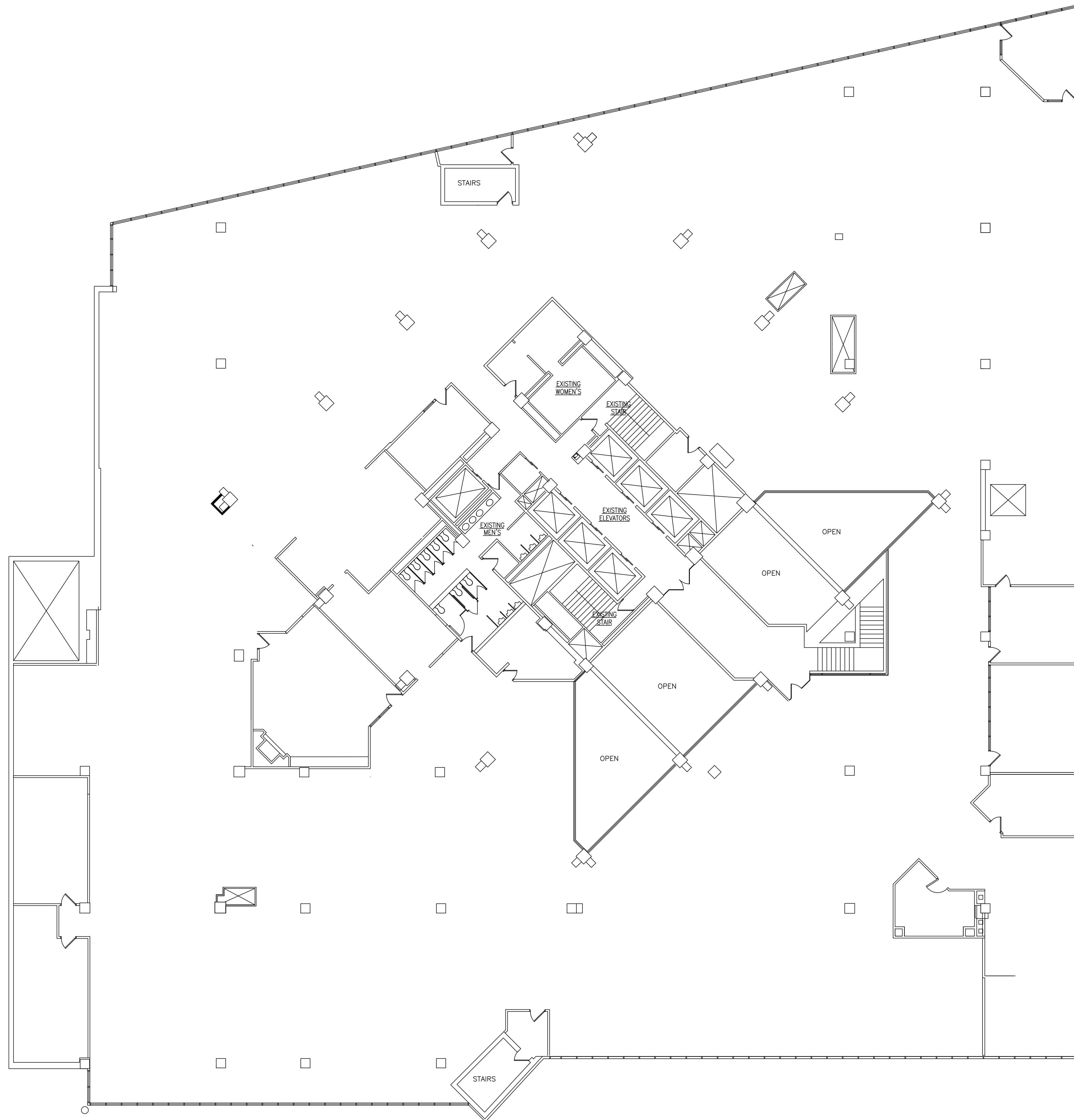
SECOND FLOOR PLAN - 200 FIRST FEDERAL SCALE: 3/32" = 1'-0"